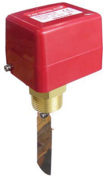
MODEL : WFS-1001-H Plastic Cover

Where an operating control failure would result in personal injury and/or loss of property, it is the responsibility of user to add safety devices that protect against, or supervisory systems that warn of control failure.